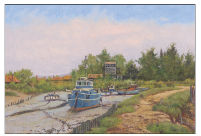
Brancaster Staithe, Norfolk.