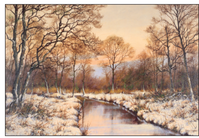
Winter Stream, Thetford.