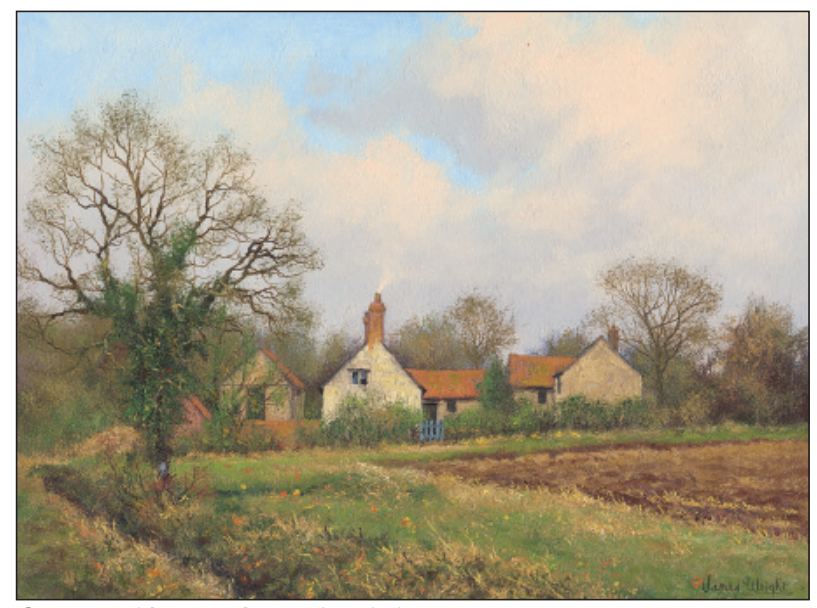
Cottage and Barns at Baston, Lincolnshire.